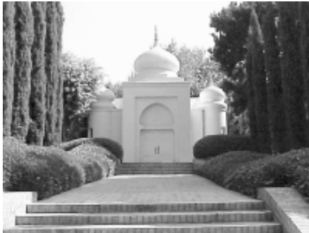
The Vedanta Society of Southern California was established in 1934 as a nonprofit organization "to promote harmony between Eastern and Western thought, and recognition of the truth in all the great religions of the world."

Vedanta can be described as a search for self-knowledge, as well as the search for God—which can be perceived as an